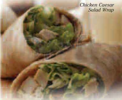
Chicken Caesar Salad Wrap